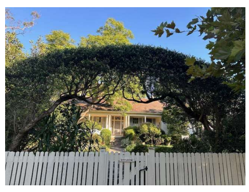
'Eryldene' entrance.