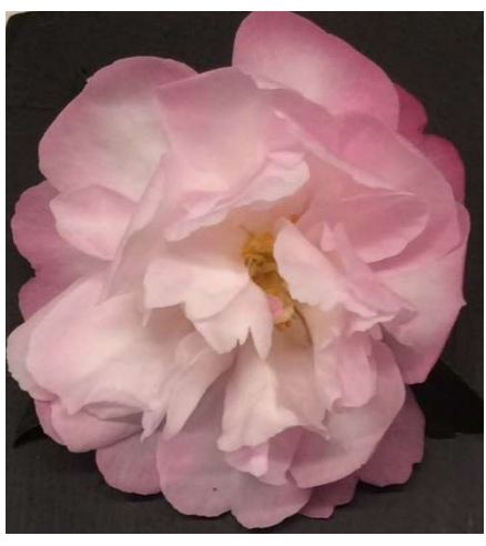
Champion Bloom April meeting. C. sasanqua 'Paradise Blush'. Class 3 Sasanqua other forms.