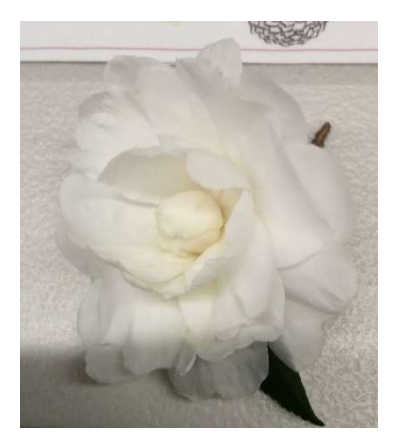
C. Sasanqua 'Mine No Yaki'. Class 2 Sasanqua formal double.