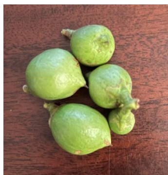
White Baby Bear