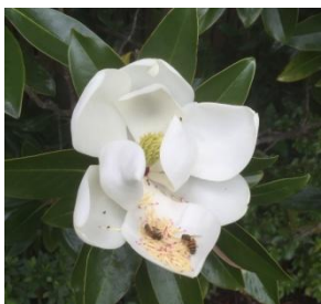
Bull Bay Magnolia and Friends