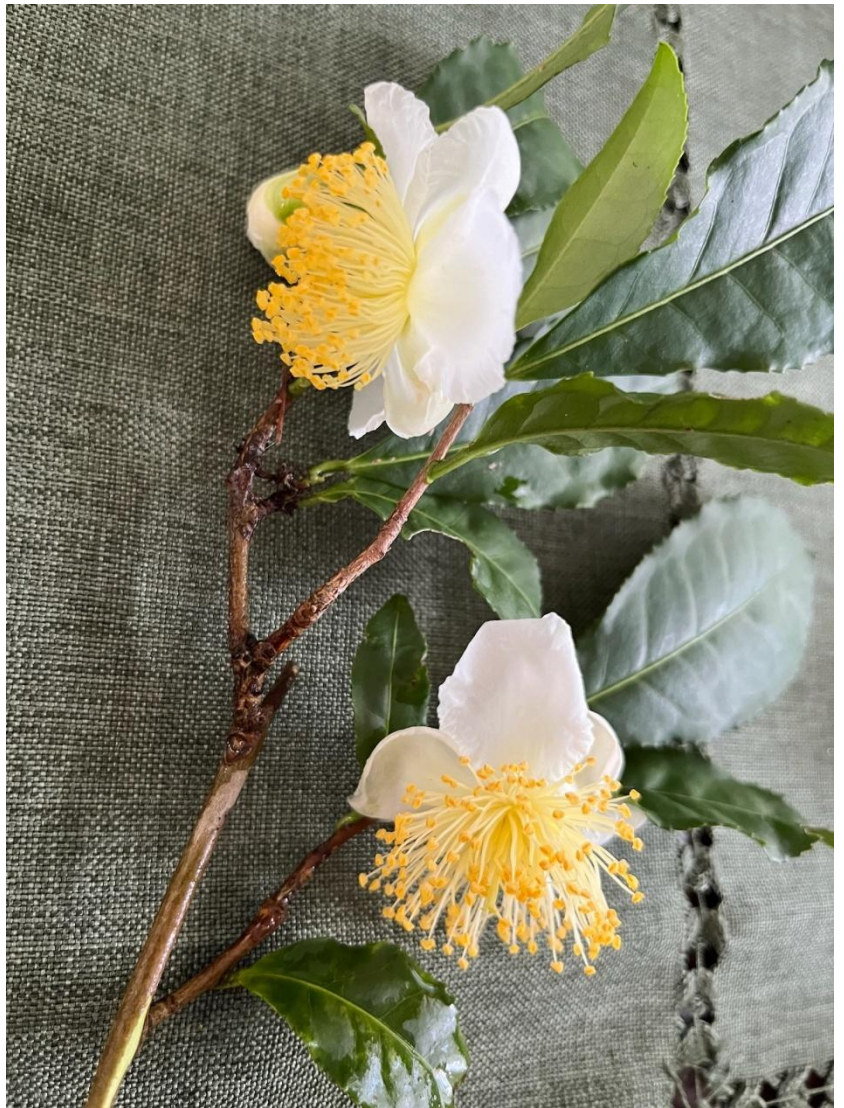
As always in our garden the first Camellia blooms of the season are sinensis and its derivatives