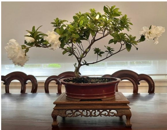
Satsuki Azalea Bonsai