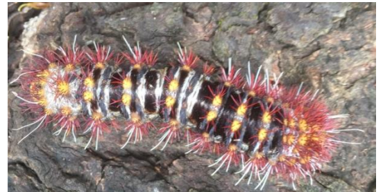
White-stemmed Gum Moth